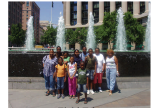
Field Trip Naval Memorial Museum