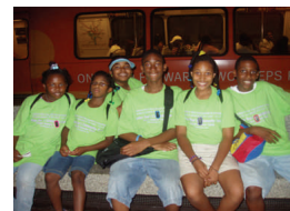
Waiting for Metro rail to ride back to Mother Dear's