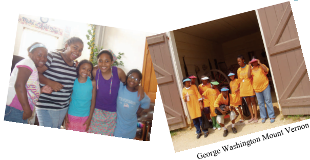
George Washington Mount Vernon